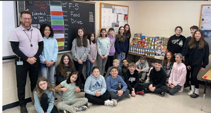
Way to go F-5 Homeroom!

HOLIDAY DANCING: The PTA Sponsored a holiday dance on Friday, December 15, 2023. The DJ sleighed it! Over 100 students came to dance the afternoon away. This was a fun afternoon and special thanks to the PTA for sponsoring and chaperoning the event. Several DVMS staff stayed to join in the fun.