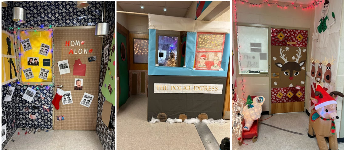
SOME OF DVMS'S DOOR DECORATIONS

PAJAMA DAY AT DVMS: Truly a Christmas miracle!!! The students and staff received permission to demonstrate their holiday spirit celebrating Friday, December 22 wearing pajama pants and other holiday spirited clothing. We also were happy to see many sporting our school colors black and white. On this day, most wore pajamas! The students and staff did an outstanding job being responsible with this opportunity.