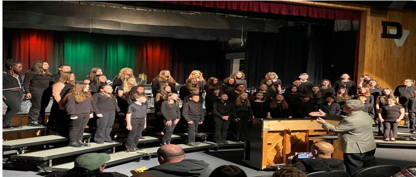
Chorus Grade 6