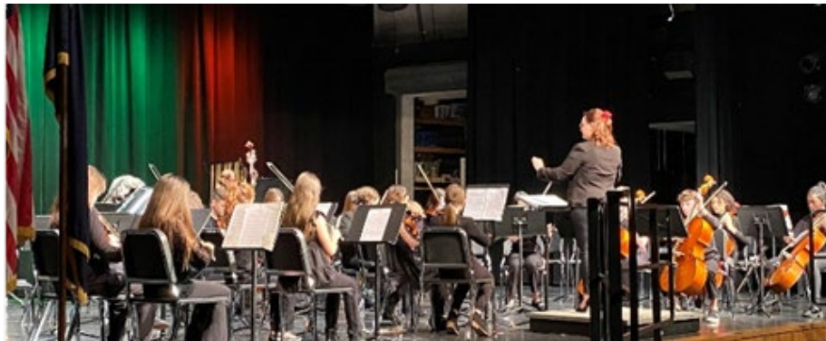
Band Grade 6